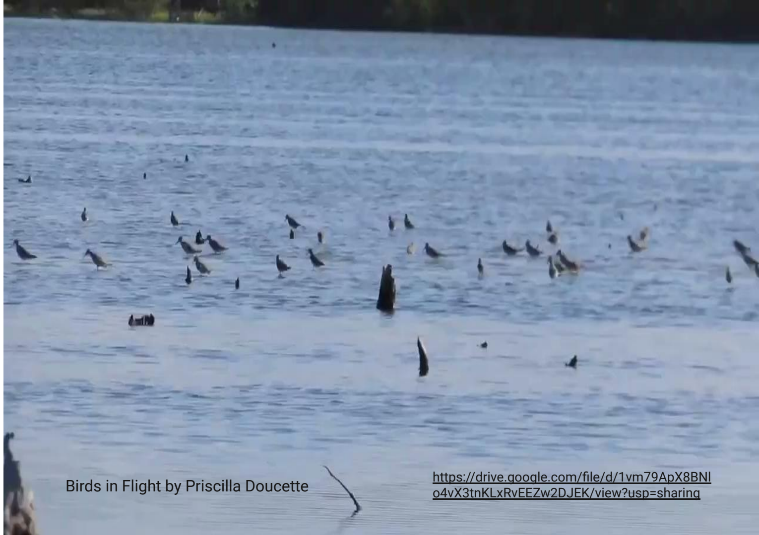
Birds in Flight by Priscilla Doucette

https://drive.google.com/file/d/1vm79ApX8BNlo4vX3tnKLxRvEEZw2DJEK/view?usp=sharing